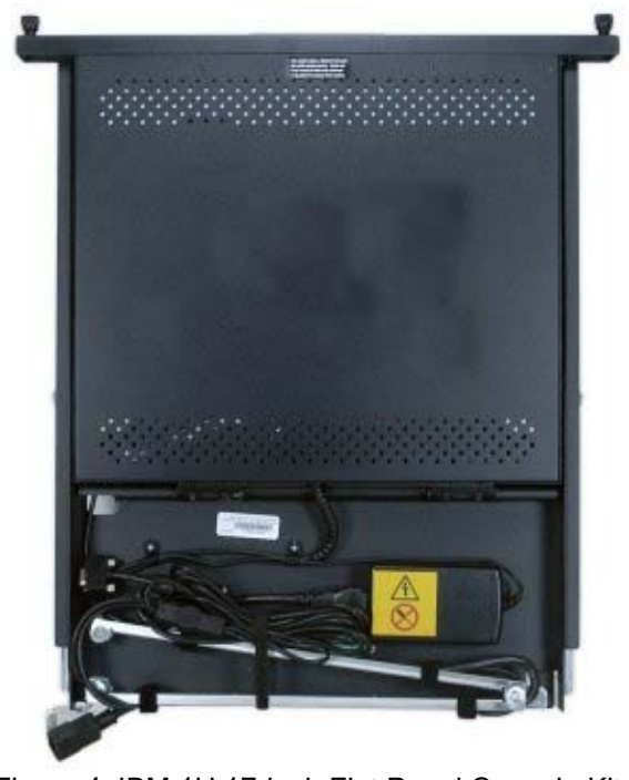
Figure 4. IBM 1U 17-inch Flat Panel Console Kit